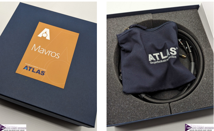
In the box

These 1m Atlas Ultra L Stereo RCA Interconnects are priced at £1,858.50 (Including VAT), delivered. Other and custom lengths are available.